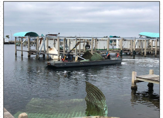
Cleaning up the Marina and clearing sub-surface debris was a recovery milestone for the City.

To carry out infrastructure repairs, the City secured Federal Emergency Management Agency (FEMA) Public Assistance funding, which will also be used to install new bulkheads. As of October 2020, this recovery project is ongoing and the repairs to the Marina's piles and bulkheads are about 70% complete.