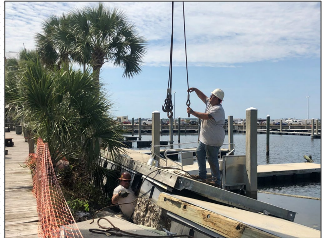
Crews worked to remove damaged structures and debris from the Marina in the spring of 2020.

Hurricane Michael caused significant damage to the Marina. Debris was left on the docks and in the water and sub-surface sand movement meant the Marina's channels were shallower than before the storm. In addition to the debris, the Marina's infrastructure was heavily damaged, leaving docks, boat slips, and walkways in need of repairs. To this day, the Marina's slips are limited.